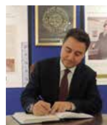
HE Mr Ali Babacan

HE Mr Ali Babacan, Adviser to the Prime Minister of the Republic of Turkey visited the Centre in the Spring. He took the time to meet Fellows and to discuss opportunities further to enhance the Centre's existing strong academic links with individuals and institutions in Turkey.