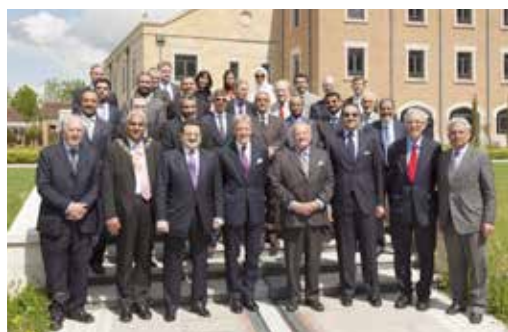
The Saudi Oxbridge Alumni Association in the Centre's Garden

The Centre continues to support the development of alumni associations relevant to the Centre's interests and work. The