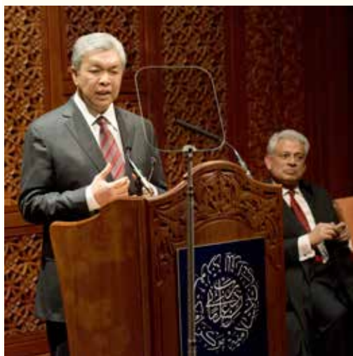
HE Dato' Seri Dr Ahmad Zahid Hamidi, Deputy Prime Minister of Malaysia

HE Dato' Seri Dr Ahmad Zahid Hamidi, the Deputy Prime Minister of Malaysia, visited the Centre and delivered a well-attended