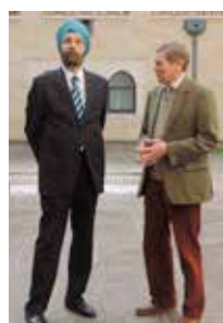
Mr Navtej Sarna with the Registrar