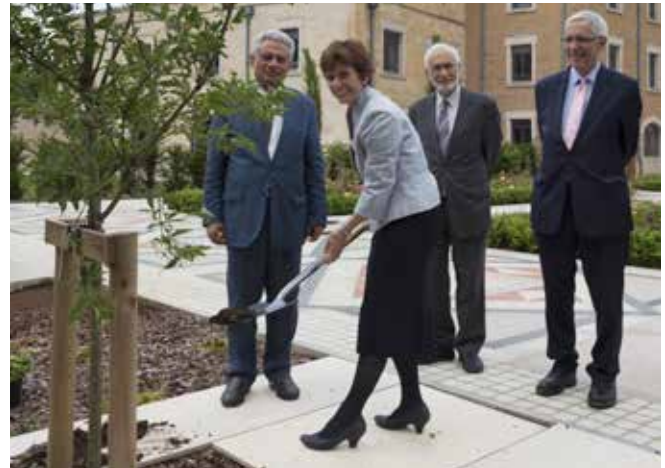
Professor Louise Richardson, Vice-Chancellor of Oxford University, plants a tree in the Prince of Wales' Garden

The Centre has, from its foundation, worked to develop the closest links and cooperation with the University and this first visit by Professor Richardson was a welcome opportunity to brief her on the Centre's work and to discuss future plans. She also viewed the new facilities now available in the Centre's building.