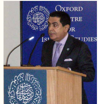
HE Mr Nassir Abdulaziz Al Nasser speaking at the Examination Schools

flict, and to meet humanitarian needs across the world, calling on all member states to support fully the vital work of the United Nations. In discussion he commented on a range of issues that the UN currently faces including the need of reform.