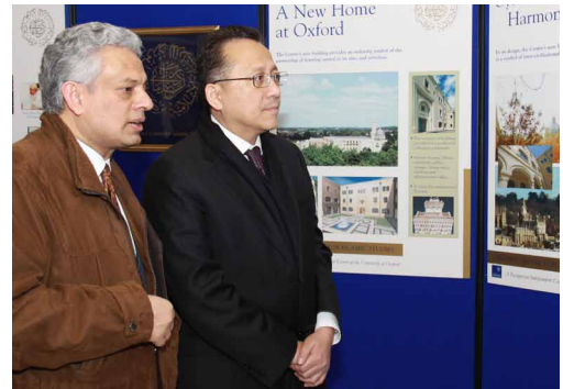
Mr Irman Gusman and the Director viewing the exhibition at the New Building

Back at the Centre’s current premises His Excellency was able to discuss the Centre’s aims and objectives in more detail, to interact with Centre Fellows and staff, and to assess the potential for enhanced cooperation with Indonesian academic institu-