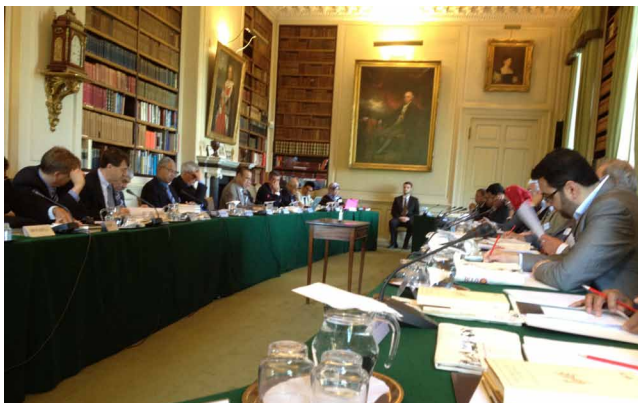
Participants during the conference at Ditchley

The Centre, jointly with the Universiti Teknologi Malaysia, held an international conference on 'Science in Muslim Societies: Past and Present' at Ditchley Park in May 2012.