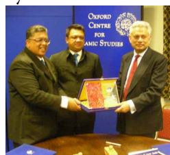
The Crown Prince of Perlis and the Vice Chancellor of UniMAP with the Director

The Centre hosted a delegation led by the Crown Prince of Perlis, HRH Tuanku Syed Faizuddin Putra Jamalullail. A Memorandum of Understanding was signed with Universiti Malaysia Perlis as the basis for a range of co-operative research and teaching activities.