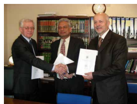
The Rector of University of Sarajevo with the Director after signing the Memorandum of Understanding