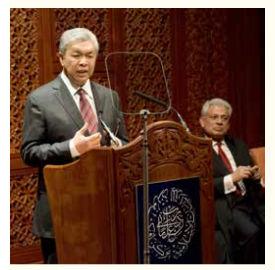
HE Dato' Seri Dr Ahmad Zahid Hamidi, Deputy Prime Minister of Malaysia

HE Dato' Seri Dr Ahmad Zahid Hamidi, the Deputy Prime Minister of Malaysia, visited the Centre and delivered a well-attended