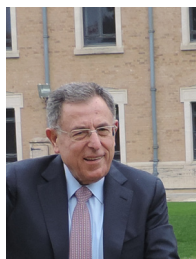
HE Mr Fouad Siniora

HE Mr Fouad Siniora, former Prime Minister of Lebanon, accompanied by HE The Ambassador of Lebanon, was another most welcome special guest at the Centre's