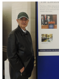
Tun Abdullah Badawi

Tun Dato' Sri Abdullah Badawi, former Prime Minister of Malaysia, visited the Centre, accompanied by his wife Tun Jean Abdullah. Tun Abdullah Badawi, a longstanding friend, lectured at the Centre during his term as Prime Minister in 2004 on 'Malaysia, Islam and the Wider World'. This welcome return visit concluded with a dinner hosted in his honour.