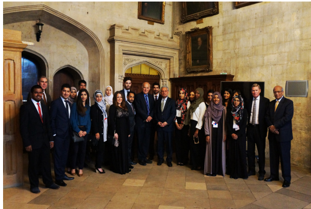
Sir Vince Cable (centre) with the participants of YMLP 2015 at Christ Church

The Young Muslim Leadership Programme celebrated its tenth year in 2015 with participants from a range of career backgrounds including the civil service, banking and accountancy, the law, media and digital sectors, non-governmental organisations and academia. The group was able to interact with an array of distinguished leaders from all walks of