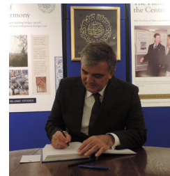
HE Dr Abdullah Gül