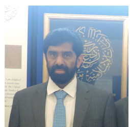
HE Dr Saleh Al-Nabit

The Centre also hosted HE Dr Saleh Al-Nabit, the Minister for Development, Planning and Statistics of the State of Qatar. The possibilities for future collaboration in a number of fields were discussed and, after a lunch hosted in his honour, the Minister had the opportunity to visit the Centre's new building and be briefed on its academic activities, both in Oxford and internationally.