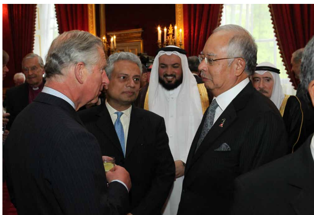
The Prince of Wales with the Prime Minister of Malaysia

British politicians from across the political spectrum, including the Secretary of State for Communities and Local Government, the Attorney General and the Minister of State for Universities and Science also joined the celebration.