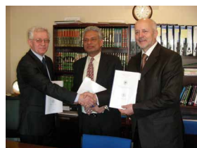
The Rector of University of Sarajevo with the Director after signing the Memorandum of Understanding