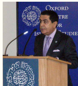
HE Mr Nassir Abdulaziz Al Nasser speaking at the Examination Schools

flict, and to meet humanitarian needs across the world, calling on all member states to support fully the vital work of the United Nations. In discussion he commented on a range of issues that the UN currently faces including the need of reform.