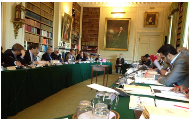
Participants during the conference at Ditchley

The Centre, jointly with the Universiti Teknologi Malaysia, held an international conference on 'Science in Muslim Societies: Past and Present' at Ditchley Park in May 2012.