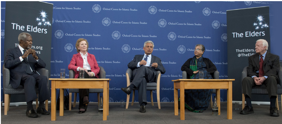
The Elders Panel Discussion at the Sheldonian Theatre, Oxford

On Thursday 29th May 2014 the Centre hosted a Panel Discussion with the Elders on 'Conflict, Dialogue and Peace: Speaking Truth to Power' at the Sheldonian Theatre in Oxford. The Panel Discussion (moderated by the Centre's Director) formed part of a series of events and lectures inaugurated by HRH The Prince of Wales in 1993 in his lecture, 'Islam and the West'. Other events in