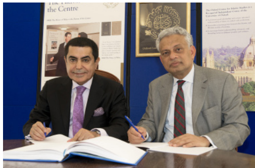
HE Mr Nassir Abdulaziz Al-Nasser signing the Memorandum of Understanding with the Director of the Centre

On Monday 9 June the Oxford Centre for Islamic Studies hosted a visit by HE Mr Nassir Abdul Aziz Al-Nasser, the United Nations Secretary General's High Representative for the Alliance of Civilisations (AOC). This was his second visit to speak at the Centre as he lectured in Oxford at the Centre's invitation on 1 March 2012 in his then capacity as President