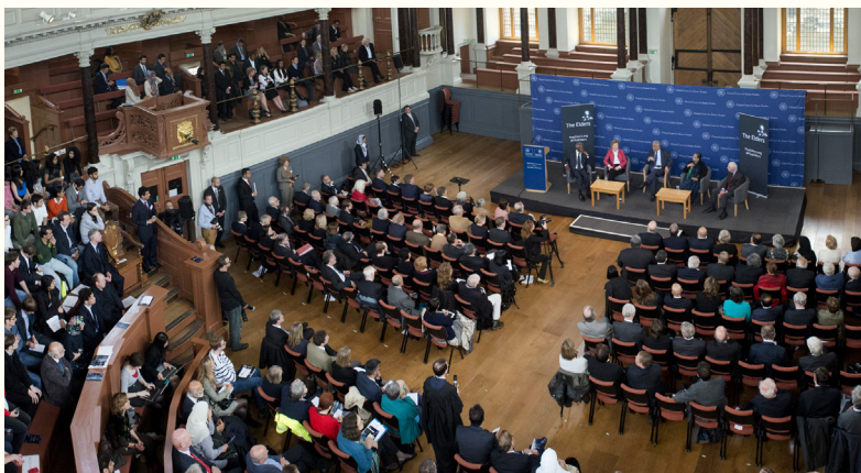
The Elders Panel Discussion

As the Director stated in his introduction to the discussion, The Elders represent an unparalleled wealth of experience in statecraft, leadership and diplomacy and, in the words of their founder Nelson Mandela, have been gathered with the mission to 'speak truth to power'.