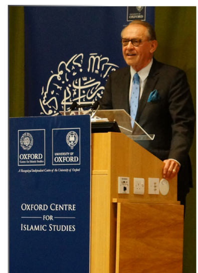
Mr Jan Eliasson

In discussion a wide range of issues were addressed, including current conflicts, as in Syria and Palestine, but also longer term global issues, such as water security and population. The vote of thanks was proposed by Lord Hannay of Chiswick, a former British Ambassador to the United Nations in New York.