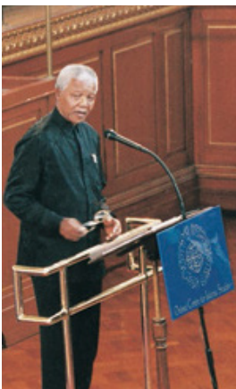
Mr Mandela lectures in 1997