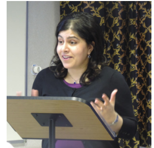
Rt Hon Baroness Warsi

Themes included the balance between integration and respect for specific ethnic and religious traditions and considerations relating to education, social cohesion, encouraging dialogue and cooperation between faith groups.