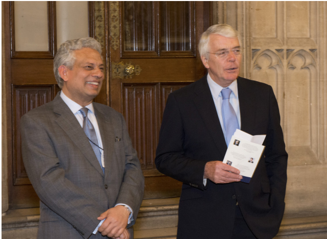
Sir John Major (with the Director) visits the Centre's exhibition at the House of Commons

The Oxford Centre for Islamic Studies mounted an exhibition in the House of Commons in the last week of February to update and brief parliamentarians on its wide-ranging programme of academic activities. Members of both Houses and all parties visited the exhibition, which