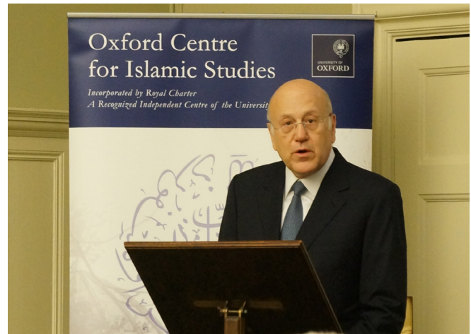
HE Mr Najib Mikati

Mr Mikati first addressed some common misconceptions about Islamic teachings, citing examples from the time of the Prophet to demonstrate the true nature of Islam. He argued that today's regional and sectarian conflicts are fuelled primarily by political and cultural, rather than religious, differences. Mr Mikati called for tolerance and mutual respect, stressing the need for moderates of all religions and experts in different fields to join together and create a non-political forum, based on dialogue and mutual respect. The question and answer session following his lecture provided the opportunity for a wider discussion about issues of politics and religion and also recent developments in the Lebanon.