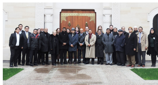
Roundtable participants at the Centre's new building

On 29 – 30 January the Centre hosted a roundtable on Islamic Social Finance in collaboration with the United Nations World Humanitarian Summit. The aims of the roundtable were to create initiatives that would diversify the humanitarian sector and encourage direct Islamic giving to humanitarian work. These would be implemented and presented at the World Humanitarian Summit in Istanbul in 2016. The roundtable was attended by more than 30 academics, practitioners and experts in Islamic finance and discussion focused on Islamic social finance bodies, public engagement and policy reform.