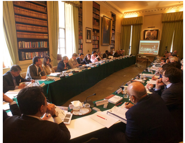
Roundtable discussion at Ditchley Park

This year's meeting entitled 'Seeking Sustainability: the Role of Islamic Finance in Transformational Change' focused on the ethical issues surrounding Islamic finance. It discussed whether Islamic finance can provide a credible, sustainable and more widely adopted financial system, particularly post banking crisis. Several case studies