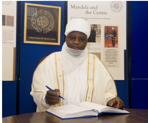
His Eminence Sultan Muhammad Sa'ad Abubakr III signing the distinguished visitors' book at the Centre's new building