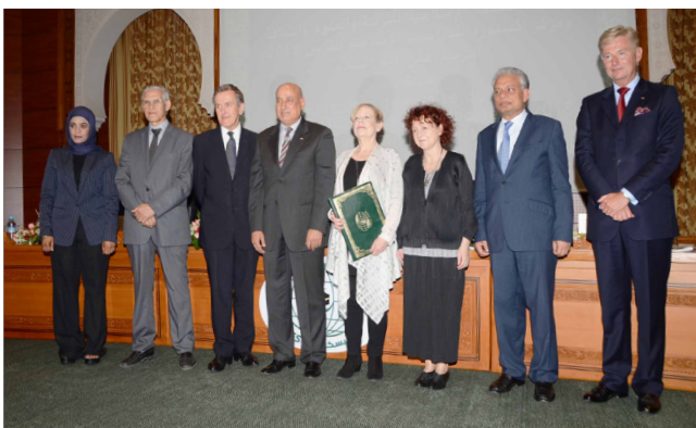
The ISESCO-OCIS Prize ceremony in Rabat

In a new joint initiative, the Oxford Centre for Islamic Studies and the Islamic Educational, Scientific and Cultural Organisation (ISESCO) awarded their inaugural annual Prize for Educators on 13 April at a ceremony at ISESCO Headquarters in Rabat.