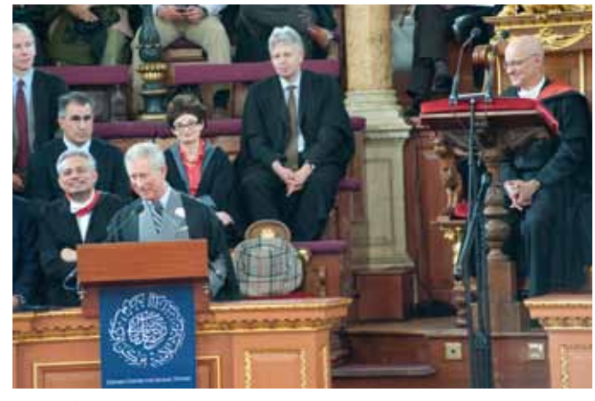
HRH The Prince of Wales lecturing in the Sheldonian

Seventeen years after his last speech on Islam and the West, which he delivered on becoming Patron of the Centre, Prince Charles spoke once more of 'healing divisions', but this time not between cultures but instead 'the widening division we are seeing in so many ways between humanity and Nature.' Questioning the sustainability of collusion between the sciences and economic materialism, he argued that, in the light of the environmental crisis the world faces, a different model must be found. Locating the roots of the problem in a 'deep, inner crisis of the soul', he emphasized the way in which religion and religious communities can offer long-term solutions by returning to spiritual and practical values. Pointing towards the success of his own schemes which attempt to combine religious practice with environmental regeneration, he concluded that reverence for the Creation must be at the core of our thought about nature.