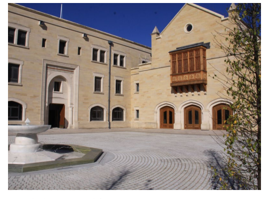
Istanbul Courtyard facing west

Alongside displays showing the way in which Turkish scholars, and leaders of opinion, have participated in, and supported,