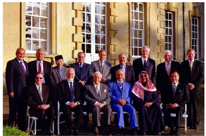
The Trustees of the Centre at Ditchley Park

The annual meeting of the Board of Trustees was held in September in Ditchley Park, Oxfordshire. The Board visited the site of the new building to view the progress achieved in construction over the past year and later