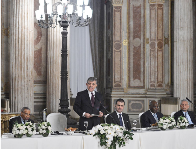
President Gül speaking at Dolmabahçe Palace

It is an academic centre of excellence for the study of Islamic culture and civilisation at the heart of Western learning, in Oxford.