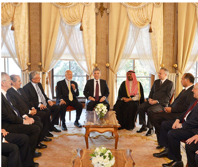
President Gül with the Centre's trustees

The Centre is truly a unique and remarkable institution. It operates at the very interface of cultures and civilisations.