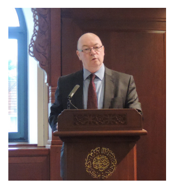
The Rt Hon Alistair Burt MP

The Rt Hon Alistair Burt MP gave a lecture at the Centre on 20 July. He is the Minister of State responsible for UK relations with