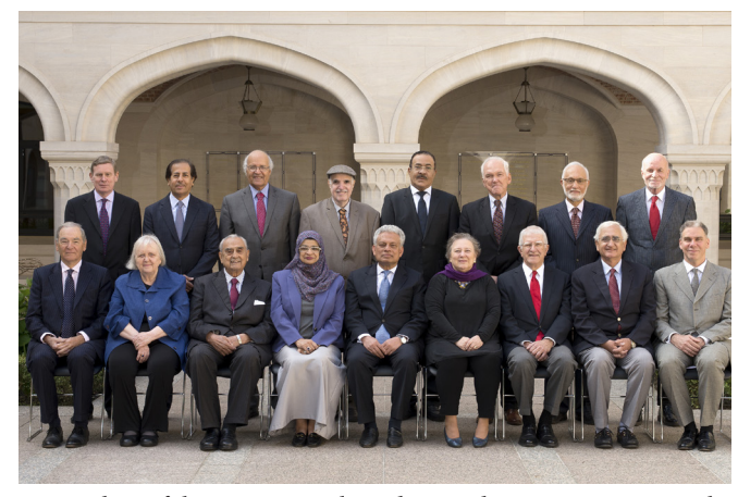
Members of the International Academic Advisory Committee at the Centre in May 2018

The International Academic Advisory Committee met in May to discuss the Centre's academic priorities as it settles into its new premises. On this occasion, the Committee reviewed the development of Centre's visiting fellowship programmes, scholarship schemes for students, research, and publication projects. Possibilities of further international partnerships with foundations, universities, and other academic institutions were explored. The remit of the committee is to set the Centre's academic work and programmes in an international context and to assist the Centre in developing its international outreach. An important focus is the promotion of dialogue and cooperation betwen scholars from different academic and cultural traditions.