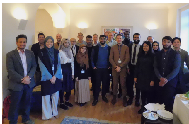
Centre Fellows with the new scholars at the Freshers' reception

The Centre's Scholarship programme remains one of the most active in Oxford, with some 21 scholars in residence during academic years 2018/19 and 2019/20. These include eight undergraduates and thirteen graduate