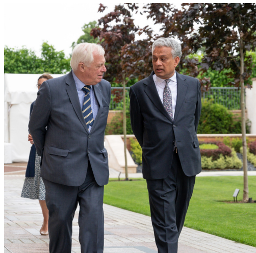
The Chancellor with the Director at the Garden Party

Guests included Heads of House and senior University office holders, as well as academic colleagues across the University's faculties and departments. The Centre also welcomed the Vice Lord Lieutenant of Oxfordshire, City and County Councillors and teachers from local schools.