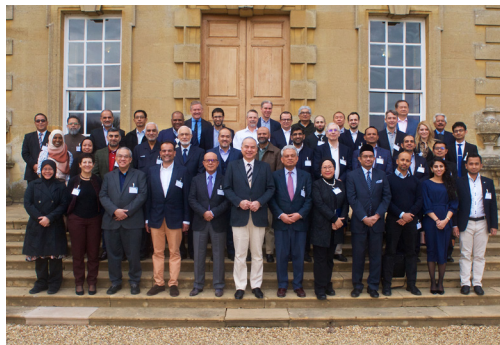
Participants at the 10th SC—OCIS Roundtable

The theme for this year's Roundtable was 'Impact Investing as an Extension to the Islamic Economy', with three key sessions