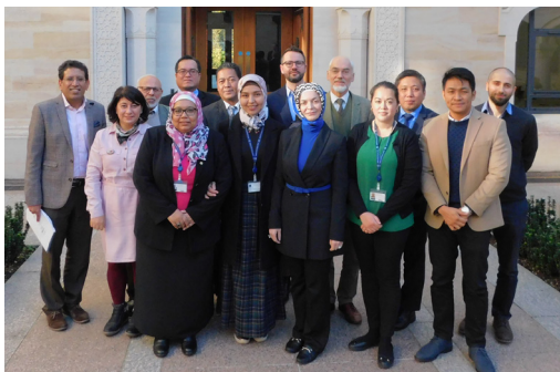
Fellows and Visiting Fellows in MT2019

The Centre's Visiting Fellowships programme continues to thrive. A total of 23 visiting scholars from ten countries were in residence at the Centre during the academic year 2018—19. These included two SC—OCIS Visiting Fellows in Islamic Finance (in partnership with the Securities Commission of Malaysia). Research topics ranged from Islamic finance, through Islamic law, linguistics, interreligious dialogue, to aspects of the social sciences as applied to the Muslim world.