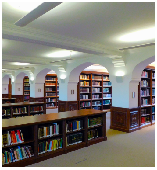
The Centre's Library

The Library's collection now stands at 32,802 volumes altogether which are searchable on the online catalogue for the University of Oxford's resources. This includes monographs and journals in English, Arabic and Urdu, and 17,000