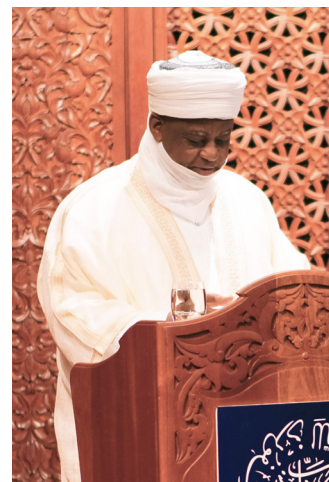
His Eminence The Sultan of Sokoto

The Alumni Day on 2nd July was well attended