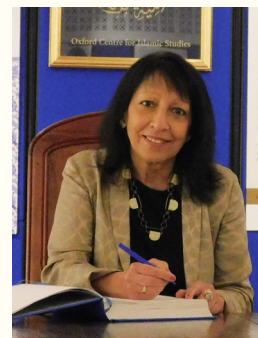
Baroness Falkner, Chair of the Equality and Human Rights Commission