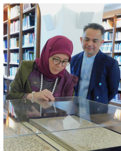
HM The Queen Consort of Malaysia

The Centre continues to enhance its longstanding links with Malaysia. In July, HM the Queen Consort of Malaysia, Tuanku Azizah Aminah of Pahang, visited the Centre. She discussed with Fellows the advancement of