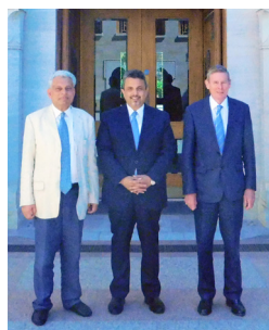
HE The Ambassador of Jordan with the Director and the Registrar