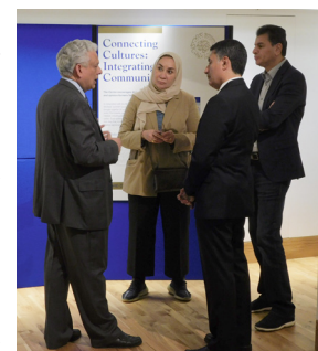
Members of the Shura Council of Saudi Arabia

On 19th May, the Centre welcomed a delegation from the Shura Council of the Kingdom of Saudi Arabia, led by HE Dr Ghazi bin Faisal bin Zaqr. The Shura Council Members were introduced to the Centre's academic activities and international network, including its long-standing links with educational institutions in Saudi Arabia.