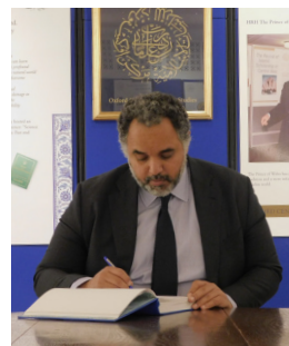
HE The Ambassador of Qatar