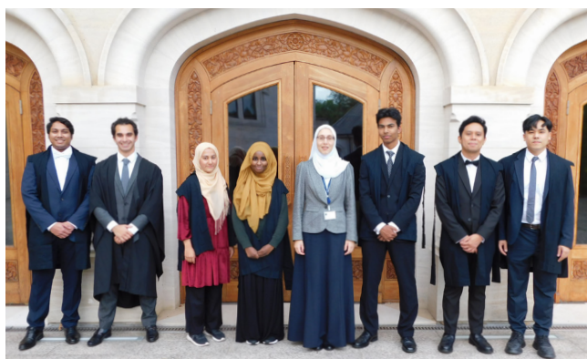
New Scholars with the Dean of Scholars in Michaelmas Term 2021

As the Centre welcomes a new cohort of Centre Scholars in October 2022, it will be celebrating the milestone of more than 100 scholarships granted since the inception of the Scholarship Programme. It is thanks to the generosity