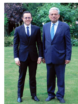
HE The Ambassador of Morocco with the Director