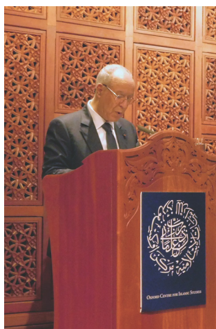
HE Dr Ahmed Toufiq

The Centre, in collaboration with the Embassy of the Kingdom of Morocco, organized a roundtable discussion on 'UK/Morocco: Connecting Two Kingdoms, Building on the past to shape the future'.