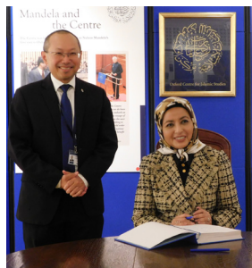
HRH The Queen of Johor with Tan Sri Abdul Wahid Omar

HRH The Queen of Johor, visited the Centre. After a tour of the Centre's building accompanied by the Director and Tan Sri Abdul Wahid Omar, Visiting Fellow of the Centre, HRH was introduced to the Centre's latest academic activities and discussed potential areas of collaboration with academic institutions in Malaysia.