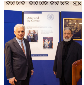
HE Mr Ghanem Al-Ghanem with the Director

HE Mr Ghanem Al-Ghanem, Minister of Endowments and Islamic Affairs, Qatar, visited the Centre on 12th January. Discussions were held with the Minister about how further to enhance the Centre's existing strong links with individuals and institutions in Qatar. The Minister was given a tour of the Centre's building and visited the Centre's exhibition to be briefed on the work of the Centre.