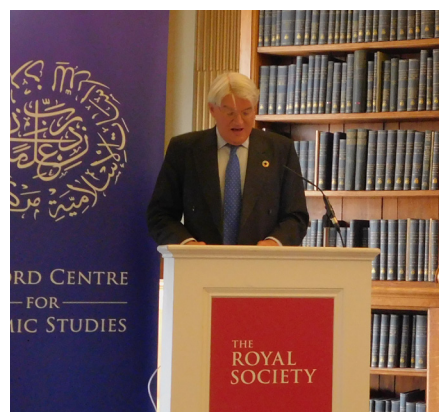
The Rt Hon Andrew Mitchell MP delivering the keynote address at the launch event