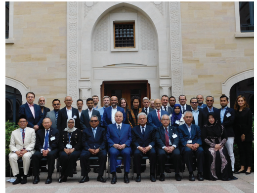
Participants of the SC-OCIS Roundtable