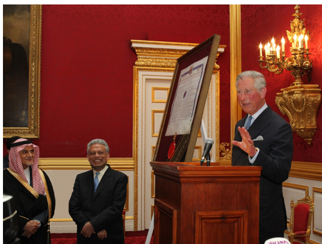
The Patron addressing the guests on the occasion of the grant of the Royal Charter to the Centre in 2012

HM King Charles in his statement on the 10 th Anniversary of the Centre