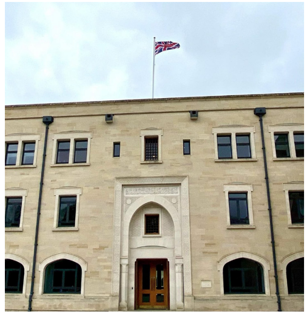
The Union flag at the Centre to mark the coronation of HM King Charles III on 6 May 2023

His Majesty, then HRH The Prince of Wales, on the award of the Royal Charter