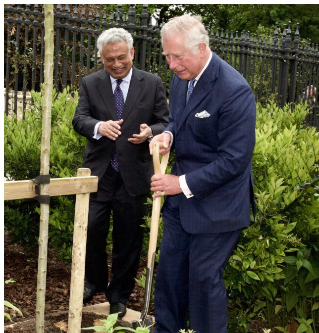
The Patron planting a tree to mark the inauguration of the Centre's new building, 2017

In 2012, Her Majesty Queen Elizabeth II granted the Centre a Royal Charter, an instrument with a 700-year history, now bestowed by the sovereign (on the advice of the Privy Council) to exceptional bodies that work in the public interest. This prestigious honour, recognised the Centre's dedication to encouraging a more informed understanding of Islamic culture and civilization.