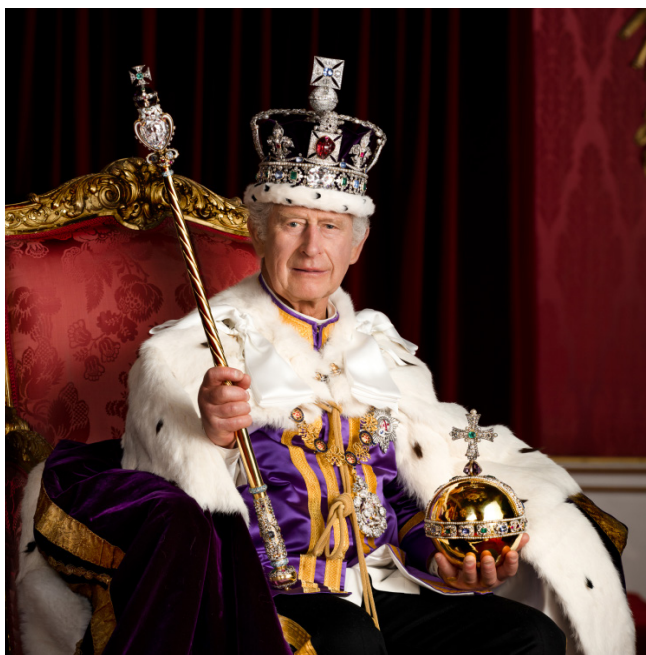
His Majesty King Charles III

The Centre participated in the nation's weekend celebrations of the coronation of His Majesty King Charles III and Her Majesty Queen Camilla. To mark the occasion the Centre flew the Union Flag and opened The Prince of Wales Garden to the public from 5th to 8th May.