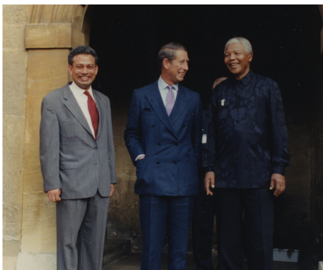
The Patron welcoming President Nelson Mandela on his visit to the Centre, 1997

The lecture also enabled the Centre to emerge as a global forum by launching the Centre's series of distinguished lectures by international leaders and figures of global academic standing. The next visiting lecturer was