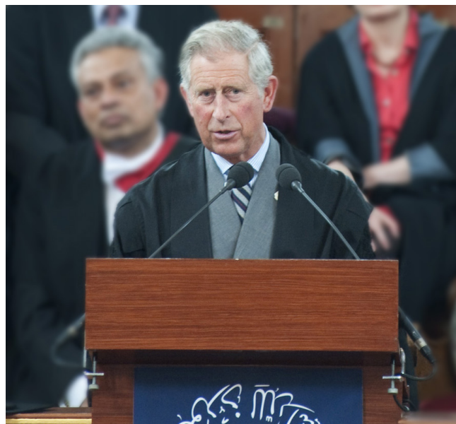
The Patron giving the lecture on 'Islam and the Environment' in 2010

President Nelson Mandela followed by other luminaries including Heads of State and Government, internationally renowned scholars, and the Secretaries-General of the United Nations, Commonwealth, Arab League, UNESCO and OIC.