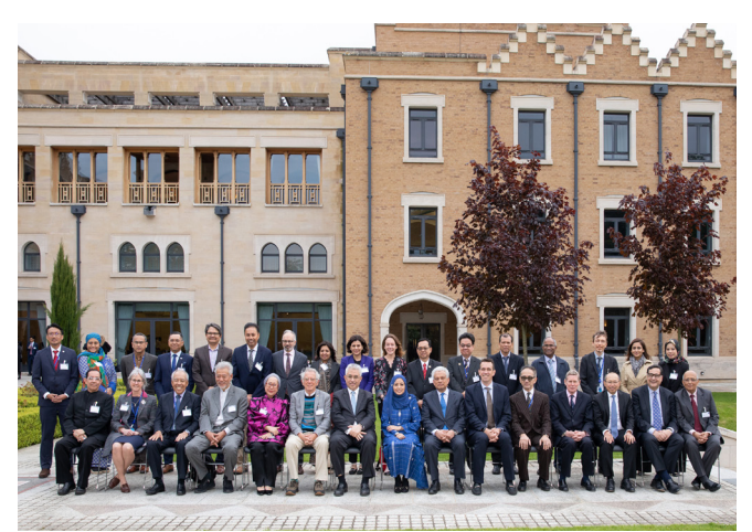
HM The Queen of Johor with conference participants

Comprehensive strategies are needed to address the impacts of climate change on Muslim societies. The Centre's 'Public Health, Science and Technology' project organized a Science Roundtable in partnership with the Universiti Teknologi Malaysia (UTM) to motivate the global community to imagine a more climate-resilient future for the Muslim world. The Roundtable was attended by around 50 participants from the UK, Malaysia and worldwide. As well as the private sector, the participants included academics and policymakers, and representatives of prominent organizations such as the World Health Organization, The Wellcome Trust and Nature Publishing. In the inaugural address, HM The Queen of Johor and Chancellor of UTM, outlined the very severe challenges facing humanity. She urged all parties to move beyond rhetoric and translate concepts and general policy goals into practical steps to adapt to, and to mitigate the effects of climate change. In the plenary session, key leaders in the field from the UK and Malaysia addressed historical, societal, ethical, technological and communications aspects of the issues. The roundtable sessions addressed