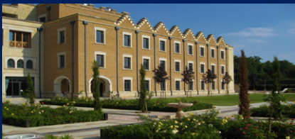
Participants enjoy full board and lodging in the Oxford Centre for Islamic Studies.

“The programme has really helped me conceptualise my personal values and brand that is so intrinsic to my religious beliefs. It has enabled me to reflect on the type of leadership we see throughout Islamic history and Muslim leaders of today; bridging the gap between this and my own leadership style.”