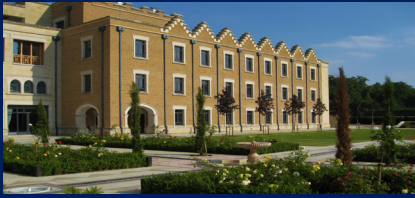
Participants enjoy full board and lodging in the Oxford Centre for Islamic Studies.

“The programme has really helped me conceptualise my personal values and brand that is so intrinsic to my religious beliefs. It has enabled me to reflect on the type of leadership we see throughout Islamic history and Muslim leaders of today; bridging the gap between this and my own leadership style.”