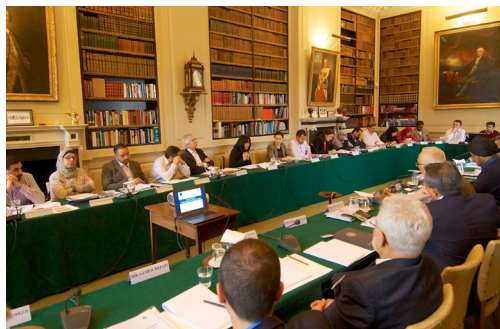
Conference participants meeting at Ditchley in March