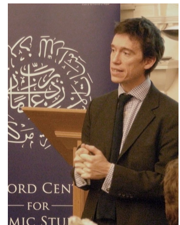
Mr Rory Stewart MP during a special seminar at the Examination Schools