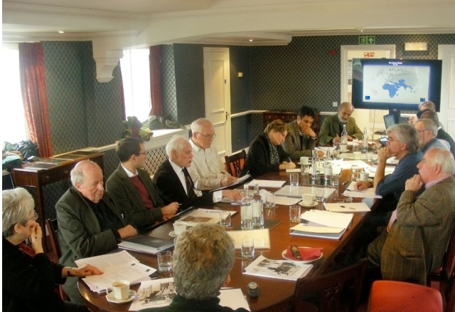
Participants at the Atlas conference held in March

The Centre has organised several academic conferences in recent months, some with international partners, in furtherance of its research commitments to the social and intellectual history of Islam in South Asia and the history