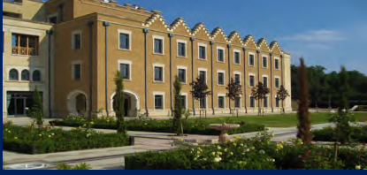
Participants enjoy full board and lodging in the Oxford Centre of Islamic Studies.

“The programme has really helped me conceptualise my personal values and brand that is so intrinsic to my religious beliefs. It has enabled me to reflect on the type of leadership we see throughout Islamic history and Muslims leaders of today; bridging the gap between this and my own leadership style.”